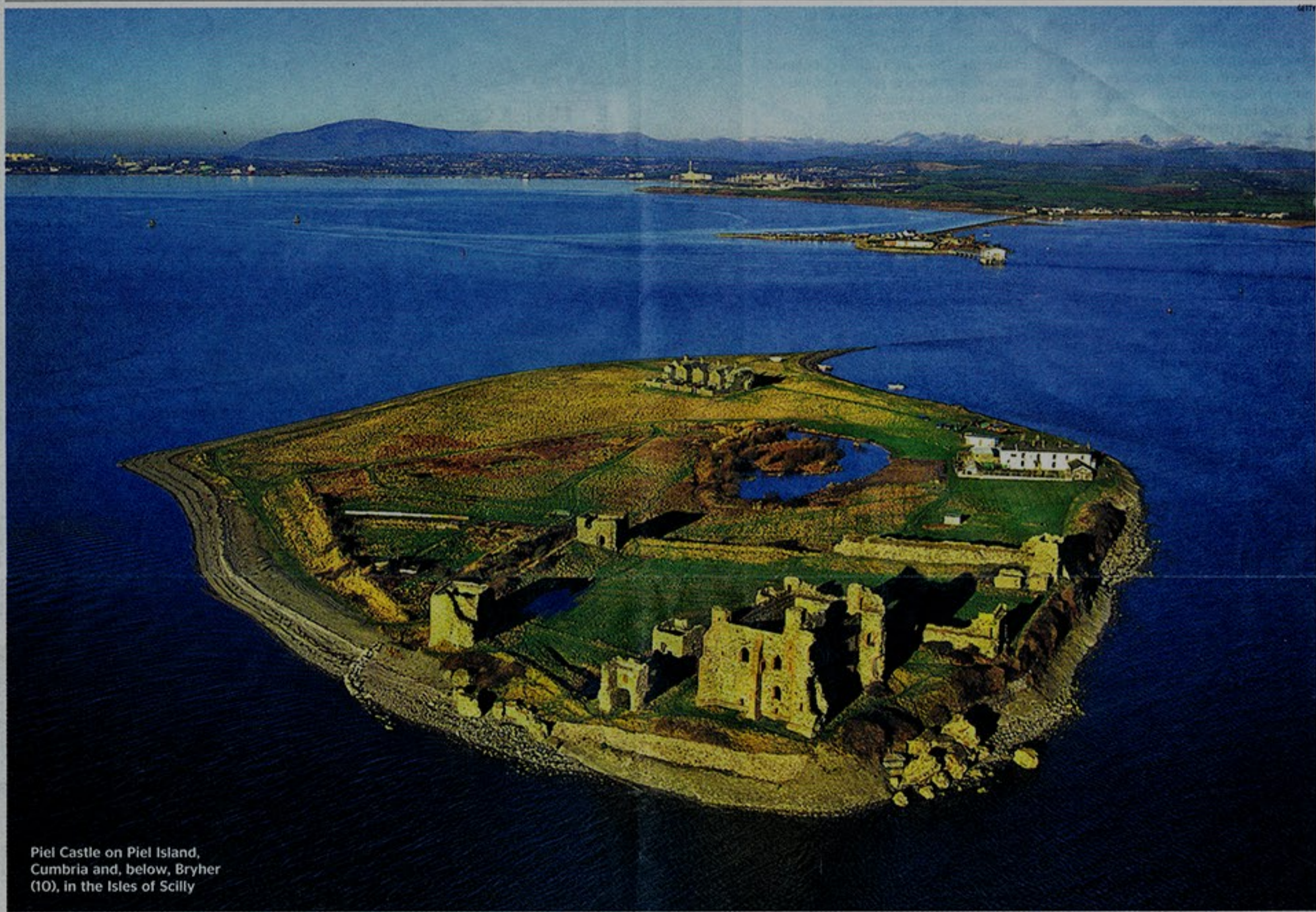
Piel Castle on Piel Island, Cumbria and, below, Bryher (10), in the Isles of Scilly